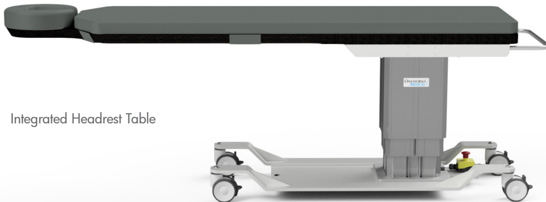
Integrated Headrest Table

Oakworks Imaging Tables have a large height range helping to create safe patient transfers while allowing doctors to stand comfortably. Our large lifting column is very rigid, ensuring rock solid support for fast imaging and procedures. Available with an integrated headrest or rectangle top.