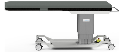
Rectangular Top Table