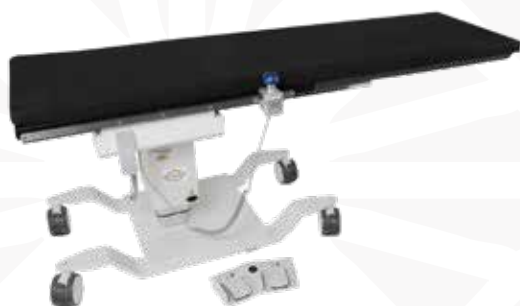
Table width: 26 in

Ideal for any procedure that requires a wide table top and heavier load capacity.