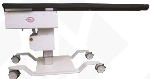
Table width: 22 in

Features a contoured table top with a facial cutout. Ideal for orthopedics, pain management and electrophysiology.